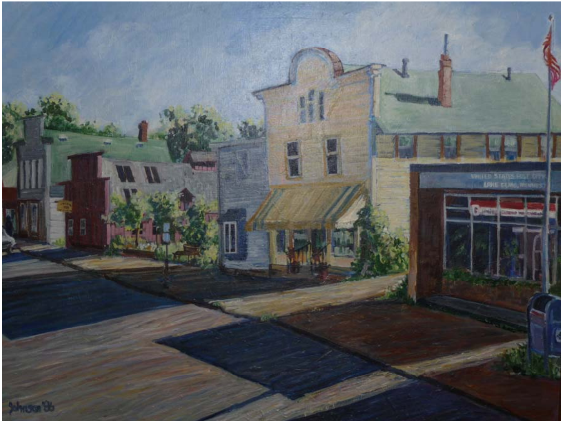
City of Lake Elmo, Minnesota